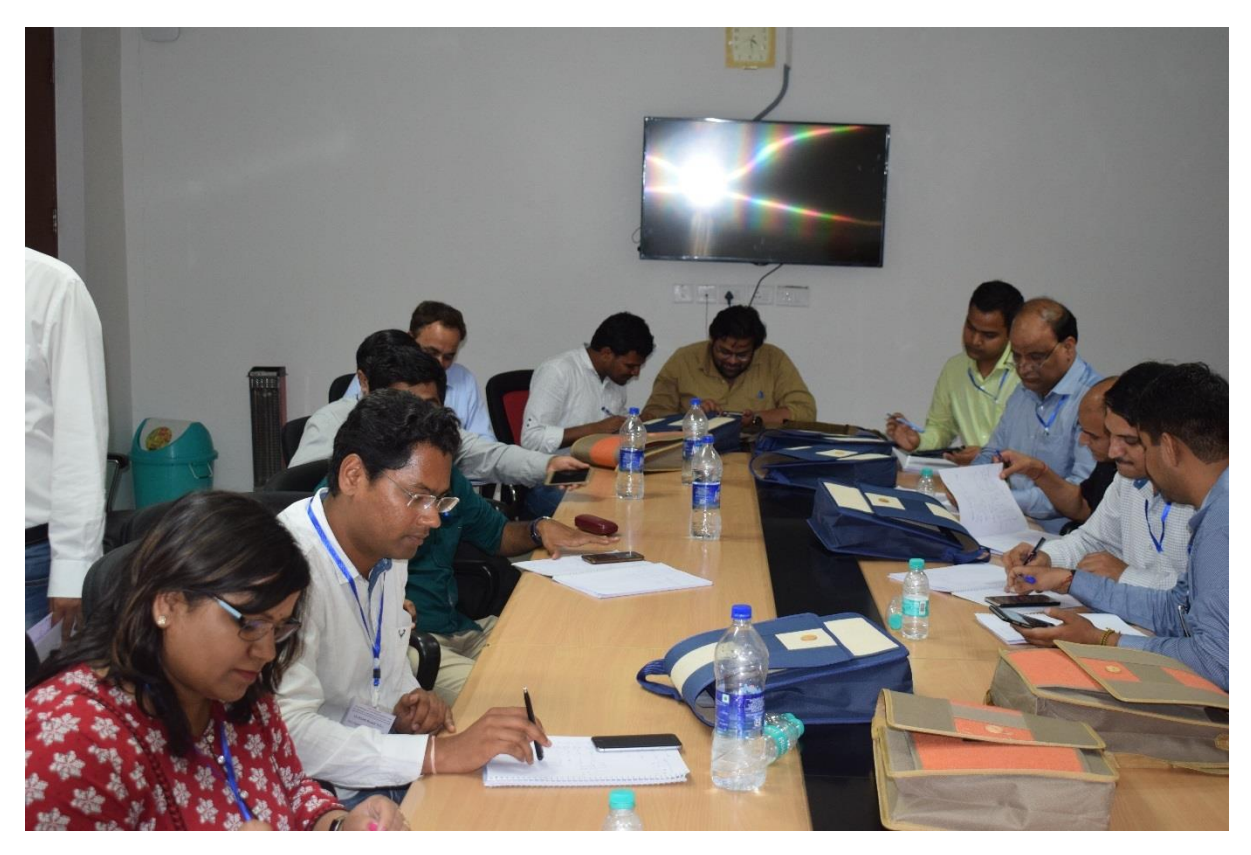
Participants busy with hands-on exercise.