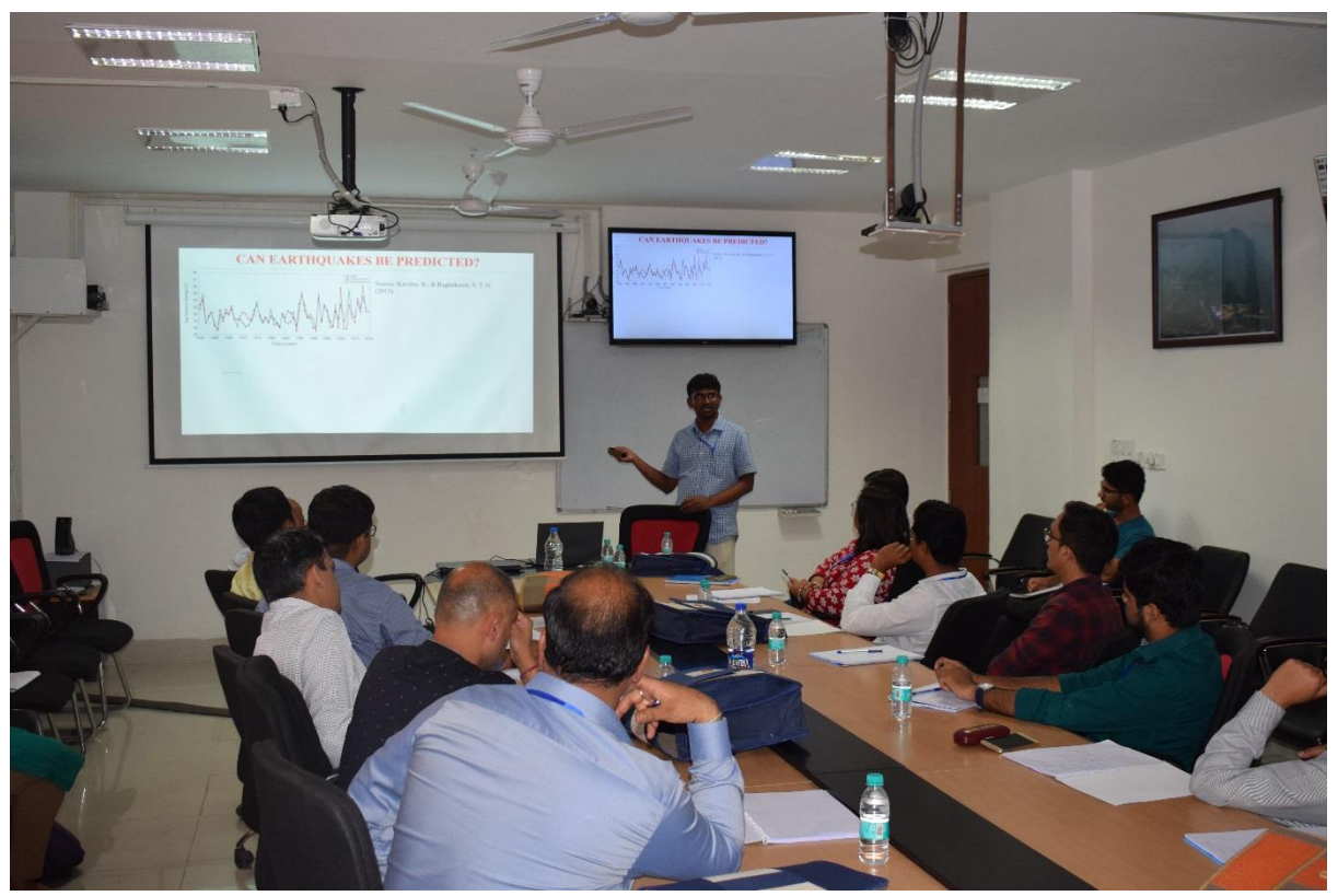
Participants engaged in lecture session.