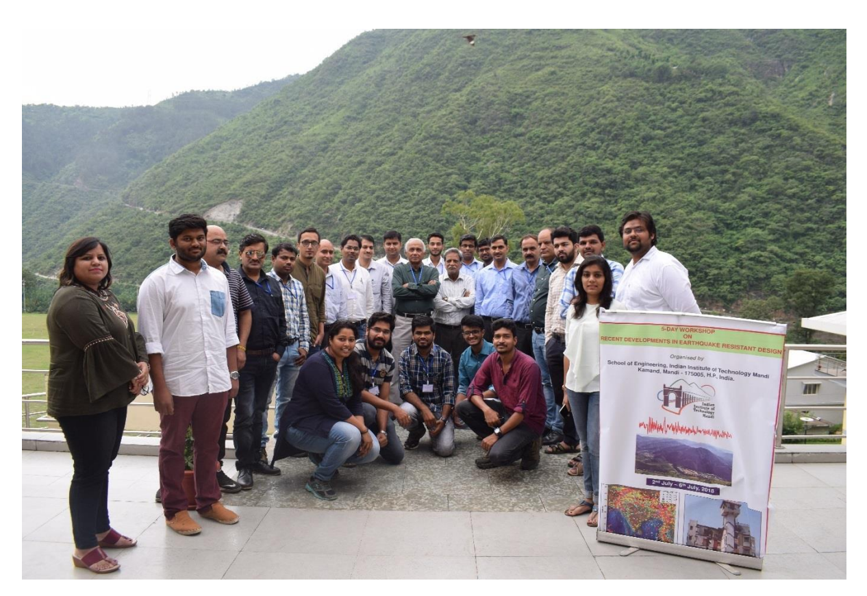
Group of participants with subject experts.